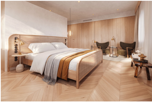
Deluxe Suite Living & sleeping area